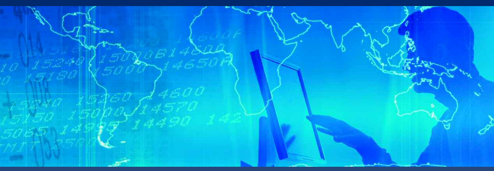
NYMEX IPORT<sup>™</sup> INDEX CONTRACTS