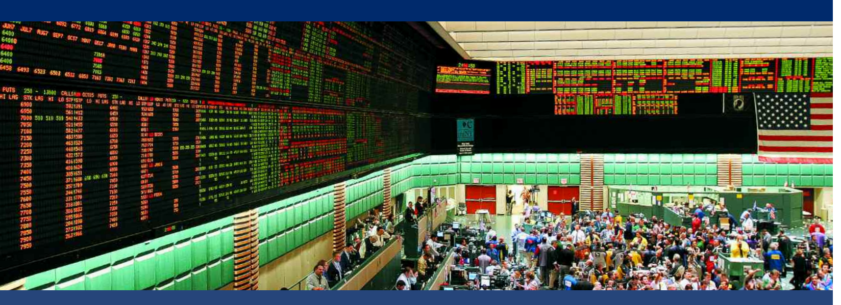
NYMEX ENERGY COMPLEX

The New York Mercantile Exchange, Inc. (NYMEX®), is the largest physical commodity futures exchange and the largest energy marketplace in the world. Its extensive suite of energy futures and options contracts offers a comprehensive series of cleared financial instruments that allow market participants to mitigate price risk in a transparent, liquid, financially secure marketplace.